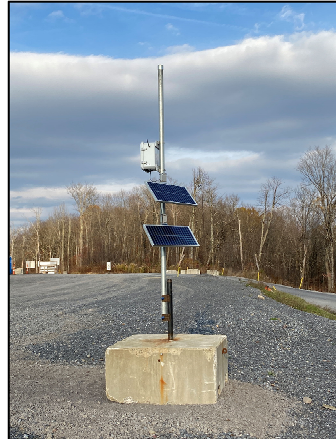
Canary X CH4 monitoring device