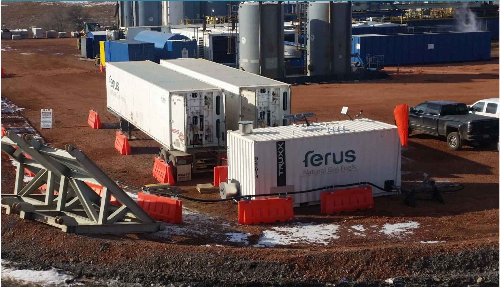
TRUXX G-Series unit with Hexagon-Lincoln trailers near Williston, ND.